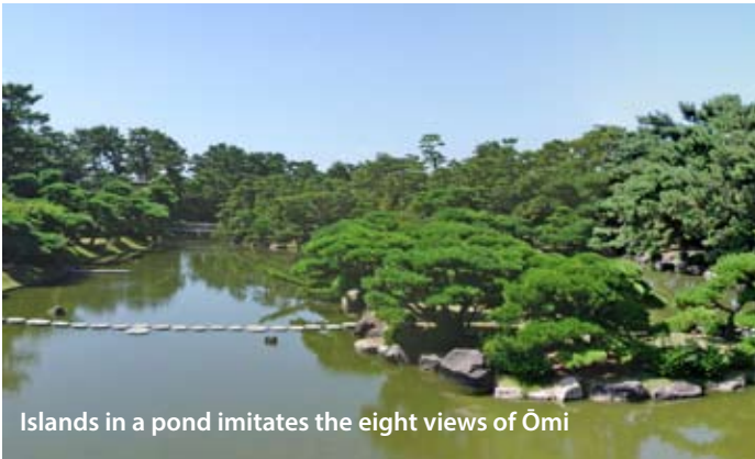
Islands in a pond imitates the eight views of Ōmi

After Age of Warring State, feudal lords built castles accompanied city area around to rule their people. With increase of its economic and political value, the city was protected by defensive moat, earth mound and stone wall. The Jōkamachi frequently became a prefectural capital later.