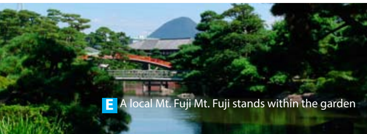
E A local Mt. Fuji Mt. Fuji stands within the garden