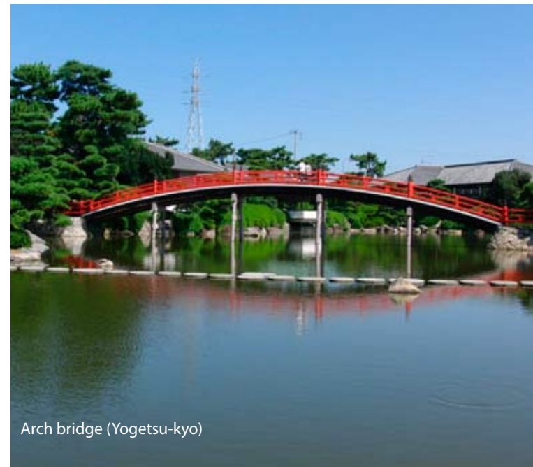
Arch bridge (Yogetsu-kyo)