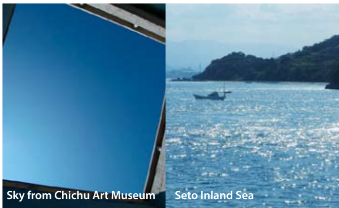
Chichu Art Museum takes diffused reflections of the sunshine in the middle of Seto Inland Sea.

Naoshima is an island in Seto Inland Sea which is one of well-known archipelagos in the world. In a Japanese comical picaresque novel named "Hizakurige" published 19th century, the picturesque scenery of the Inland Sea attributes to reflection of the sunlight in the sea and wired appearance of rock islands. Accordingly, Naoshima features the shining sunlight and its reflection.