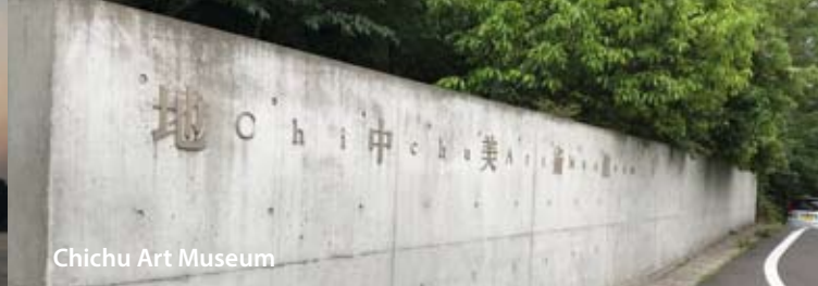
Chichu Art Museum