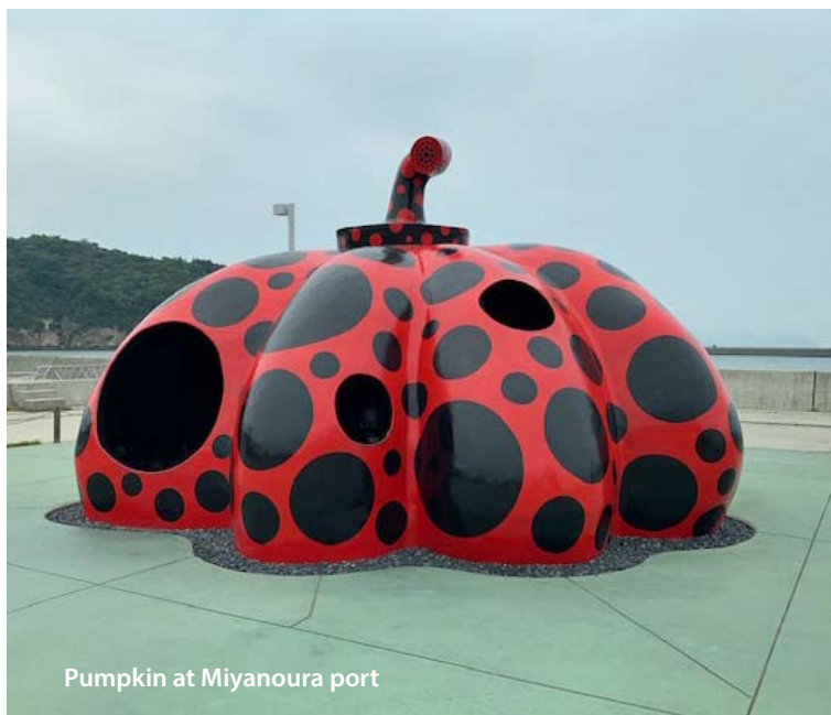
Pumpkin at Miyanoura port