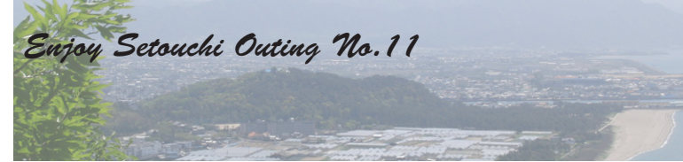
Enjoy Setouchi Outing No.11

As like Mt. Fuji, evergreen pine trees on white beach (B & C in cover) have long been the main theme of Japanese paintings. The pines were usually planted as windbreak to protect crops and houses from the sands. The pines at the foot of Kotohiki-yama hill have grown for several hundreds years, having become gigantic Bonsai (A in cover). Branches of the pine trees that could stand strong winds and sands have grown irregularly, forming gigantic "Bonsai". They show us natural and unintended artistic beauty.