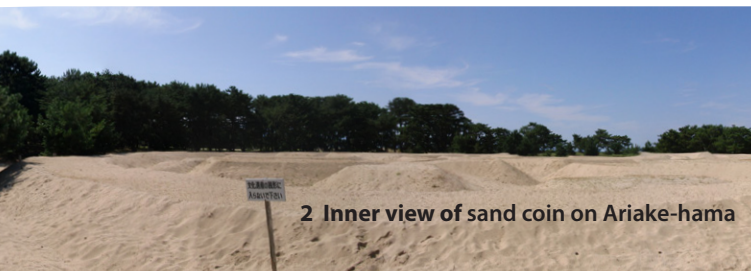
2 Inner view of sand coin on Ariake-hama