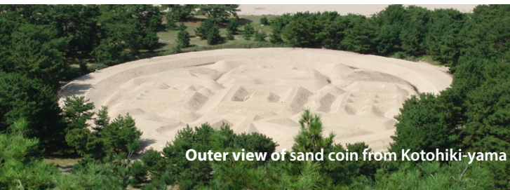
Outer view of sand coin from Kotohiki-yama

Kotohiki-yama hill is facing the open sea in which winds blow hard. Huge tidal flat appears on Ariake-hama when the tide is on the ebb.