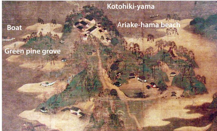
This picture painted ab. 600 years ago shows what happened when the deity, Hachiman-shin was enshrined here (see text).