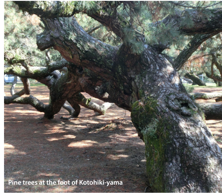
Pine trees at the foot of Kotohiki-yama

From JR Takamatsu to JR Kan-on-ji St. - 50 min. by train From JR Kan-on-ji Station- 35 min. by a walk From Sanuki Toyonaka Highway I/C - 20 min. by car