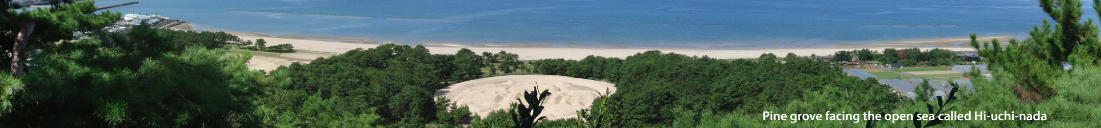
Pine grove facing the open sea called Hi-uchi-nada