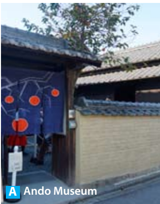
A Ando Museum