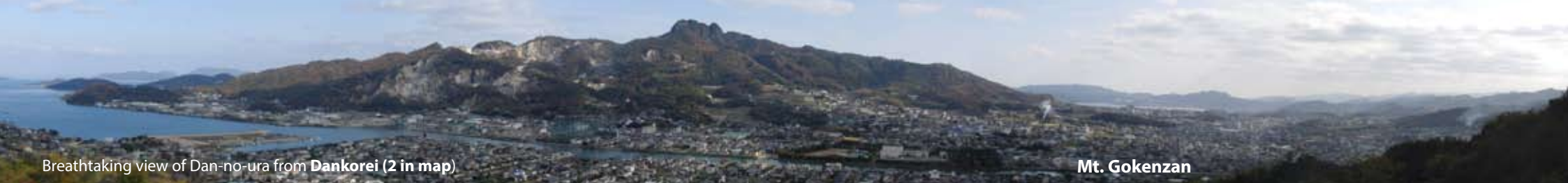
Breathtaking view of Dan-no-ura from Dankorei (2 in map)